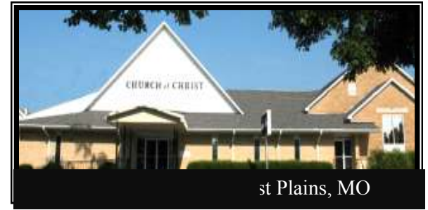
st Plains, MO